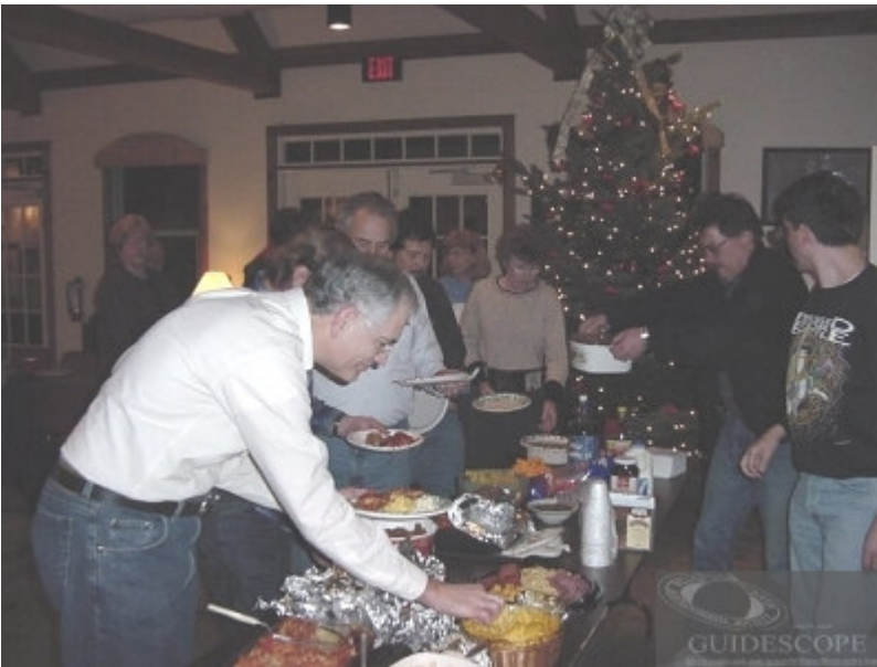
Good Prep Is